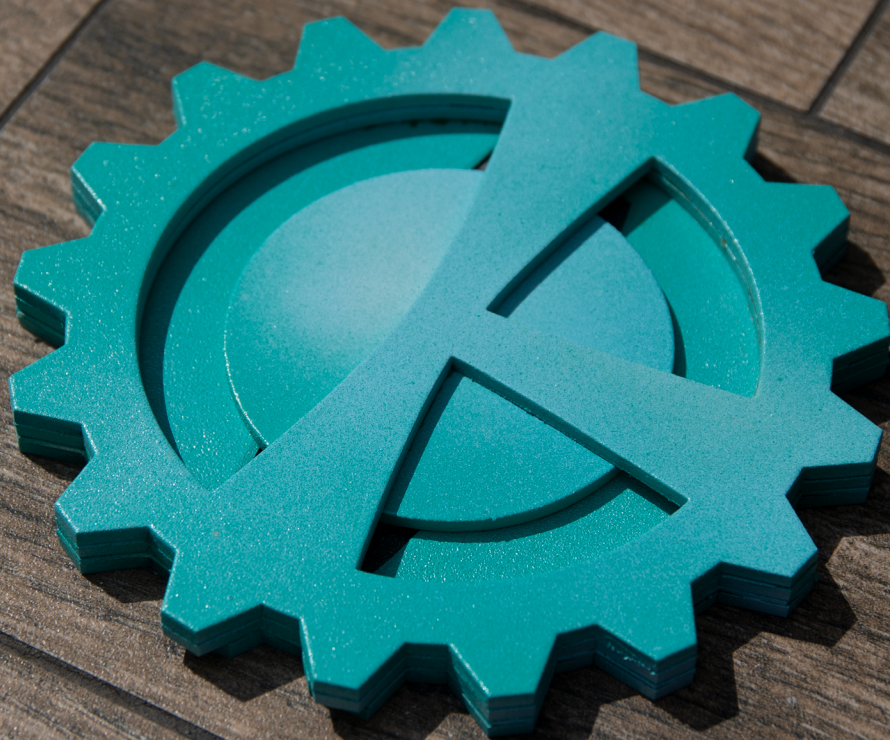
Robin Trower Sold Out Gear The Factory