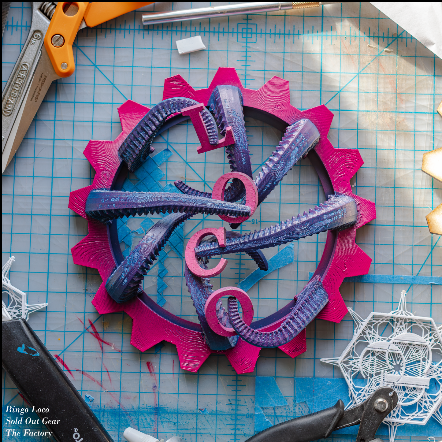
Bingo Loco Sold Out Gear The Factory