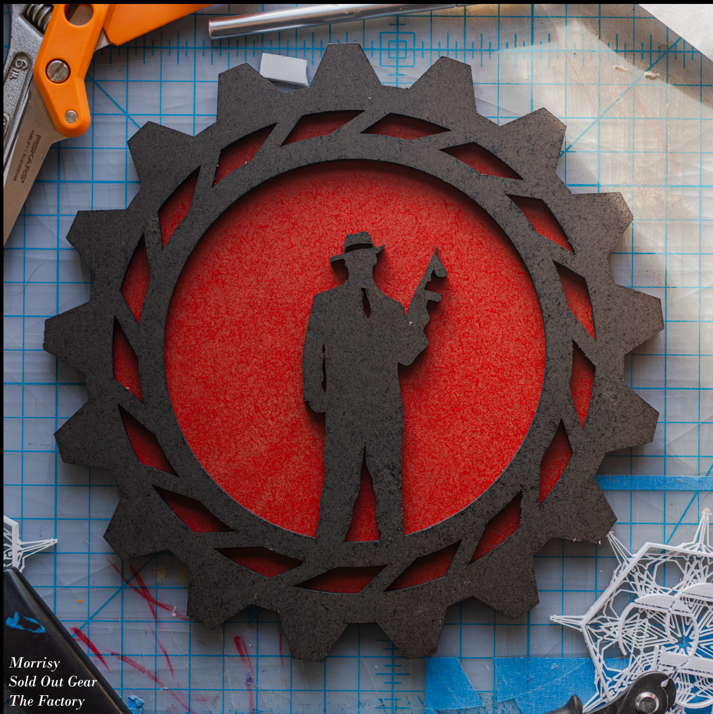
Morrissey Sold Out Gear The Factory