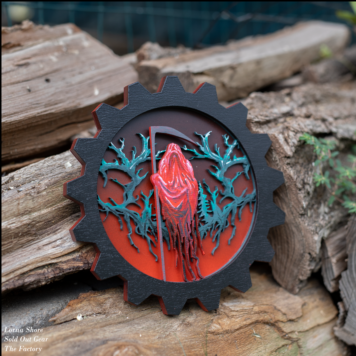
Lorna Shore Sold Out Gear The Factory