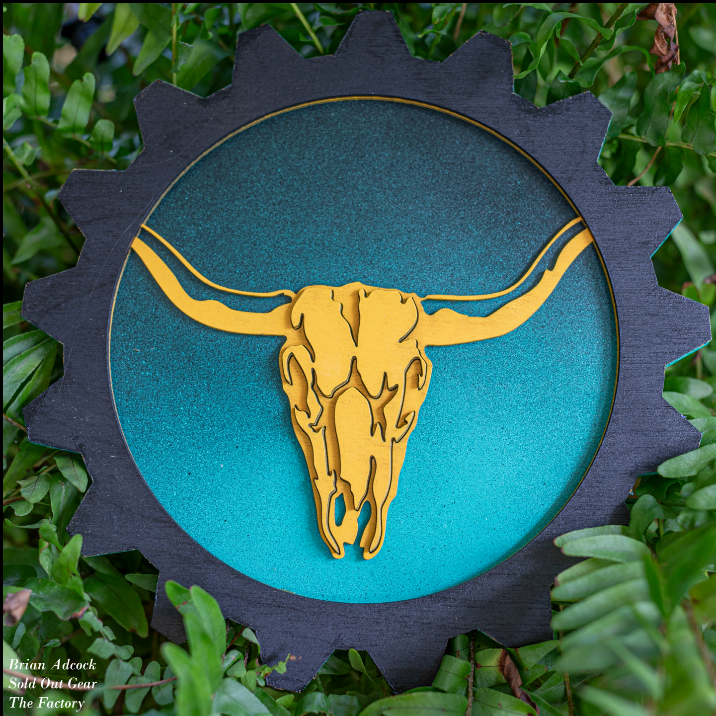
Brian Adcock Sold Out Gear The Factory