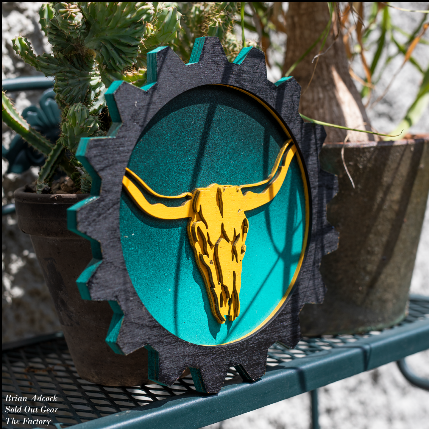
Brian Adcock Sold Out Gear The Factory