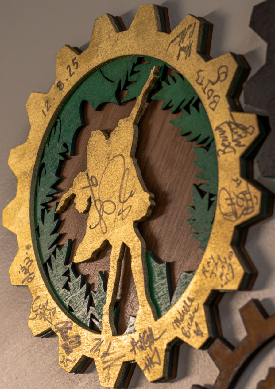
Lauren Daigle Sold Out Gear The Factory