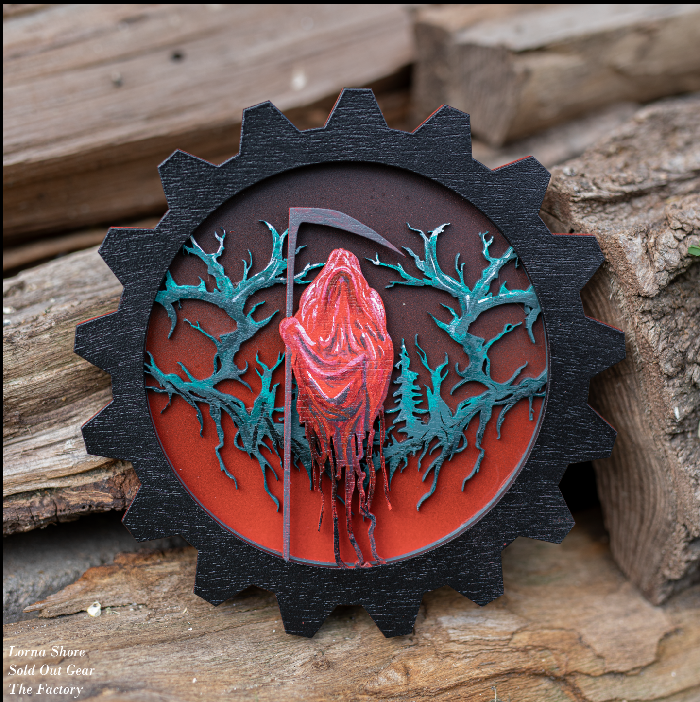
Lorna Shore Sold Out Gear The Factory