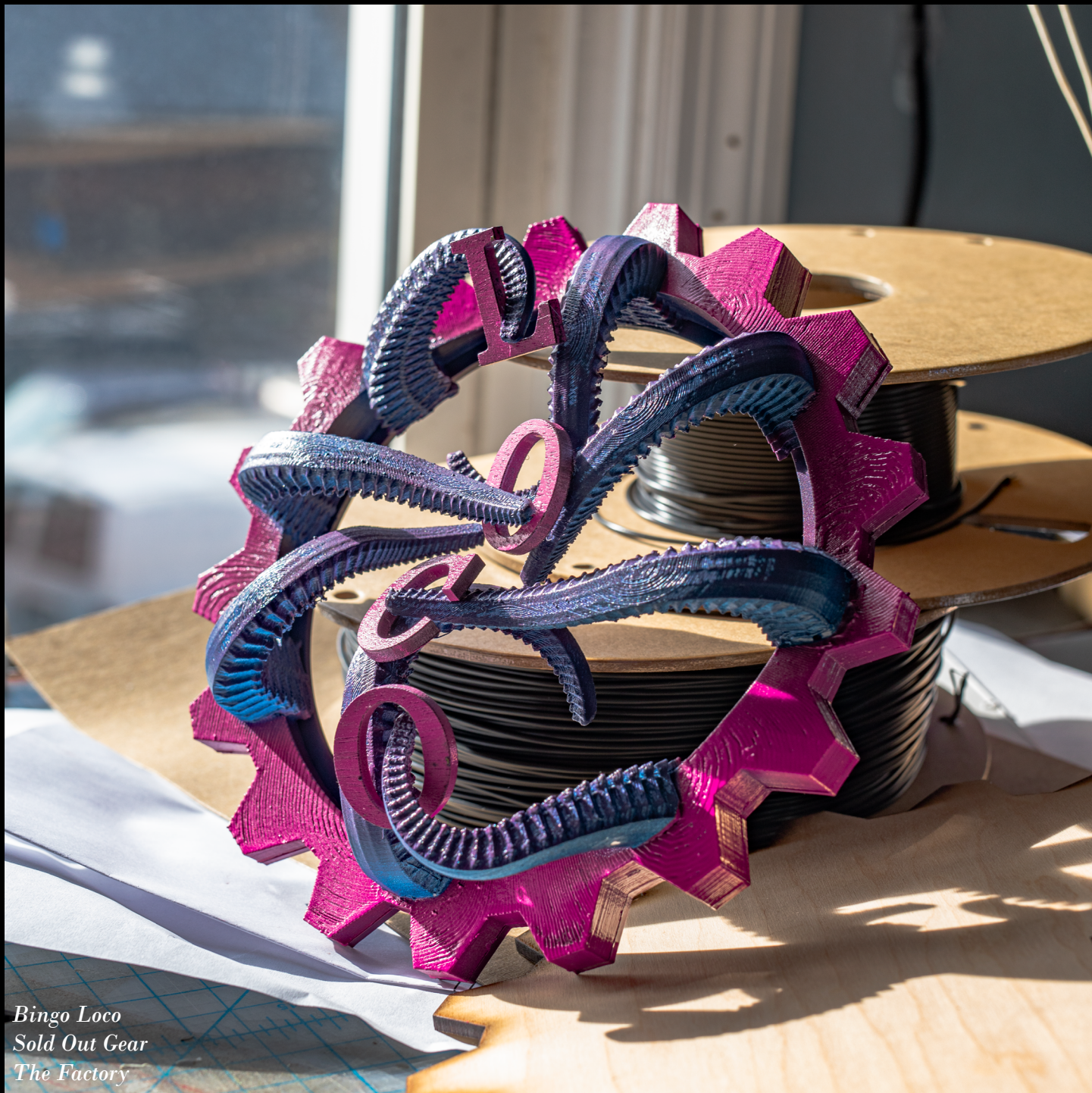
Bingo Loco Sold Out Gear The Factory